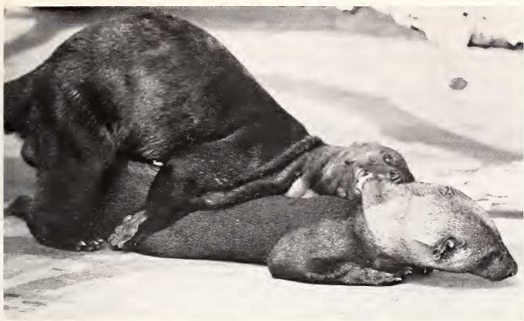
Fig. 4. Copulation. Note position of forepaws of the ♂

Scratching was observed strictly in the context of sexual situations (with one exception of the ♂ and one of the ♀), much more often in the ♀ than in the ♂; it may or may not be accompanied by the discharge of a few droplets of urine. The ♂ performs scratching with alternating movements of the feet as often as with simultaneous movements. While scratching with the hind feet, the animal may actually move forward with all four. Once the ♂ was seen after a successful copulation urinating with three short squirts and subsequent vigorous scratching.